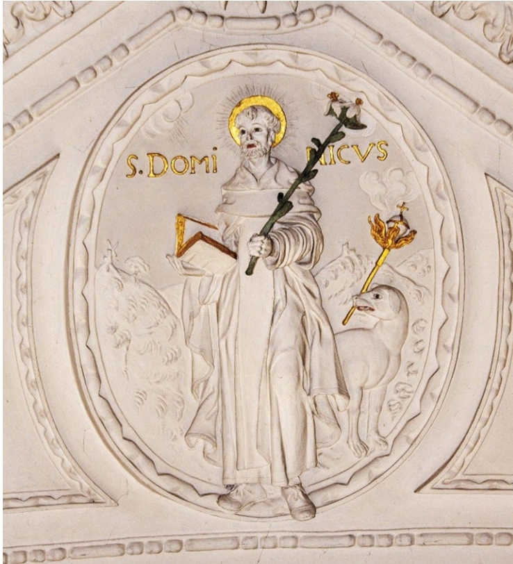
Fig. 1: Saint Dominic, stucco relief of the 17 th century, S. Andreas, Düsseldorf, photo: Hans-Josef Harbecke. Image rights: published with the permission of the owning institution, Dominikaner Düsseldorf.

In addition to the lily, crucifix and book, 1 the well-known attributes of Saint Dominic of Caleruega (c. 1170–1221) also include a small dog that usually has a flaming torch in its mouth. 2 That is what we see in numerous depictions of the saint, for example in the Dominican church St Andreas in Düsseldorf, which was originally looked after by the Jesuits. The dog with the flaming torch can be seen clearly, next to the very noticeable “walking shoes” that protrude above the stucco relief of the 17 th century (fig. 1).