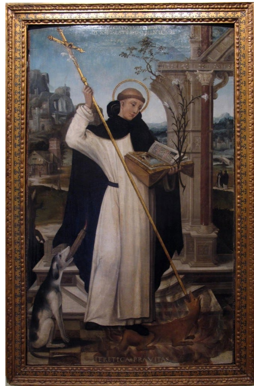
Fig. 12: Anonymous, Saint Dominic, c. 1527–1534, Museo de Bellas Artes de Córdoba , https://commons.wikimedia.org/wiki/File:Santo_Domingo_de_Guzm%C3%A1n_%28CE2196P%29_-_Museo_de_Bellas_Artes_de_C%C3%B3rdoba.jpg . License: none (Public Domain).

This heavy emphasis on the struggle against unbelievers and heretics is therefore especially interesting, since in central Italy the Inquisition had been in the hands of the Franciscans since 1254. 51 In fact, in the first decades of the 14 th century, it was in Florence that the Franciscan inquisitors were blamed for so many transgressions that in 1333 Pope John XXII sent a special investigator, who accused the inquisitor of that time of corruption and of misusing his office. 52 Rahel Meier assumes on the basis of these grievances, that the Dominicans were recommending