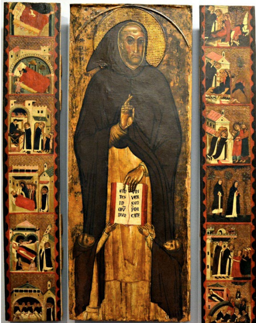
Fig. 3: Giovanni da Taranto, Saint Dominic and scenes from his life , c. 1305, Museo nazionale di Capodimonte, Napoli, https://commons.wikimedia.org/wiki/File:San_Domenico,_Giovanni_da_Taranto_001.jpg . License: CC BY-SA 4.0, https://creativecommons.org/licenses/by-sa/4.0/ .