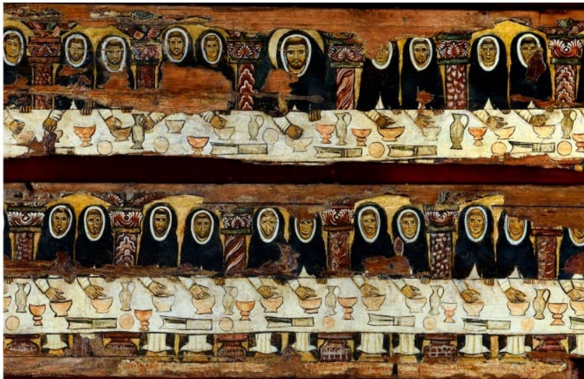
Fig. 2: Tavola della Mascarella, c. 1240, S. Maria e S. Domenico della Mascarella, Bologna