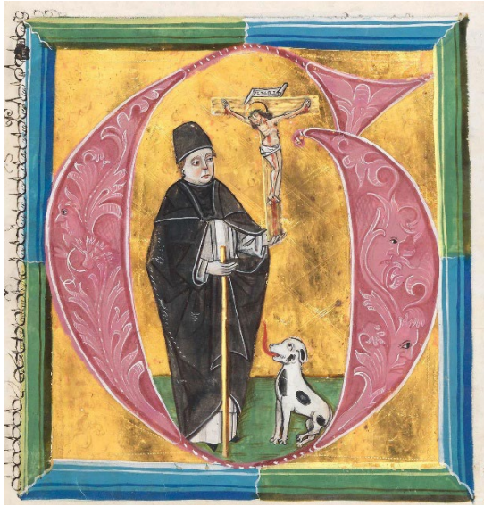
Fig. 7: Detail from Antiphonale de sanctis (part for the summer) of the Dominican sisters of Holy Cross in Regensburg, c. 1491: Initial G for the vesper antiphon “ Gaude felix parens Hispania ”, Bischöfliche Zentralbibliothek Regensburg, Proschesche Musikabteilung. Image rights: published with the permission of the owning institution: Bischöfliche Zentralbibliothek Regensburg, signature: Ch 330-1.