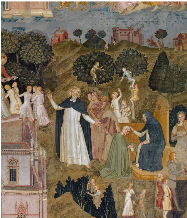
Fig. 14: Detail from Andrea di Bonaiuto, Fresco on the east wall of the Spanish Chapel of the Dominican priory Santa Maria Novella in Florence, 1366–1368, https://commons.wikimedia.org/wiki/File:Way-of-salvation-church-militant-triumphant-andrea-di-bonaiuto-1365.jpg?uselang=de#Lizenz . License: none (Public Domain, detail crop by Johanna Ecker).

In my opinion, what is emphasised above all in the frescoes of the Spanish Chapel is the importance of the Dominican order for knowledge and study and its role as an arbiter of salvation. In the fresco on the east wall, Saint Dominic points out to people the way to heaven, and in doing so is alluding to depictions of the Last Judgement, in which the archangel Michael is given this role. Just how heaven can be reached by believers despite their personal failings is shown by a confession scene in which a Dominican grants absolution (fig. 14). 59 This was probably influenced by the Specchio di vera penitenza , a popular text on confession by the well-known Dominican Jacopo Passavanti, who was no longer alive when the frescoes were painted. 60