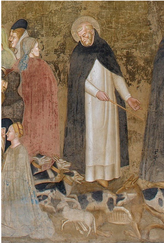
Fig. 11: Detail from Andrea di Bonaiuto, Fresco on the east wall of the Spanish Chapel of the Dominican priory Santa Maria Novella in Florence, 1366–1368 , https://commons.wikimedia.org/wiki/File:Way-of-salvation-church-militant-triumphant-andrea-di-bonaiuto-1365.jpg?u-selang=de#Lizenz . License: none (Public Domain, detail crop by Johanna Ecker).