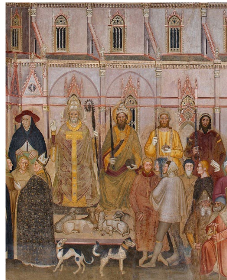
Fig. 9 and fig. 10: Details from Andrea di Bonaiuto, Fresco on the east wall of the Spanish Chapel of the Dominican priory Santa Maria Novella in Florence, 1366–1368, https://commons.wikimedia.org/wiki/File:Way-of-salvation-church-militant-triumphant-andrea-di-bonaiuto-1365.jpg?use-lang=de#Lizenz . License: none (Public Domain, detail crops by Johanna Ecker).

The fact that these black-and-white dogs clearly relate to the Dominicans is shown in the right half of the picture: Saint Dominic sends out another group of these dogs who hunt brown predators so as to protect white lambs and sheep (fig. 11). Without a doubt, this is an allusion to the watchfulness of the Dominican order against erroneous teachings. The predators shown here symbolise heretics, 49 in the same way as we see them in other depictions of Saint Dominic in which he defeats a fox (fig. 12). On the other hand, in all likelihood the animals in the Florentine fresco are wolves. While foxes could be used to depict heretics, mostly all they do is to destroy a vineyard, and they do not threaten sheep. 50