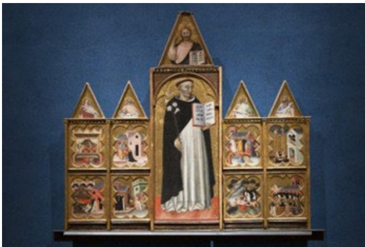
Fig. 4: Francesco Traini, Saint Dominic altarpiece , 1344/45, Museo N. S. Matteo in Pisa, Inventario dei beni storici e artistici della diocesi di Pisa , https://www.beweb.chiesacattolica.it/benistorici/bene/6880463/Traini+F.+(1344-1345)%2C+Polittico+di+San+Domenico+e+storie+della+sua+vita . License: CC BY-NC-SA 4.0, https://creativecommons.org/licenses/by-nc-sa/4.0/deed.it .