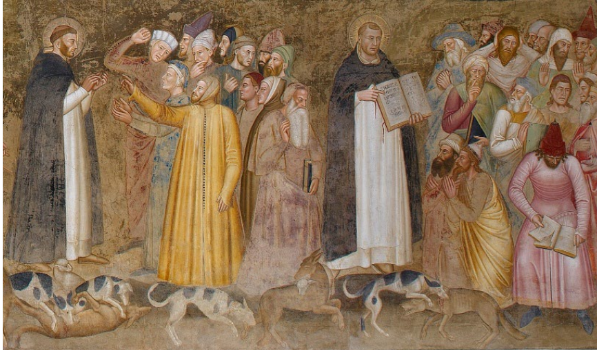
Fig. 13: Detail from Andrea di Bonaiuto, Fresco on the east wall of the Spanish Chapel of the Dominican priory Santa Maria Novella in Florence, 1366–1368

through the depiction of the black-and-white dogs that they should take over the Inquisition. 53 She even considers it possible that the unusual light-brown colour of the wolves could be understood as a pointed jab at the Franciscans with their brown habits. 54